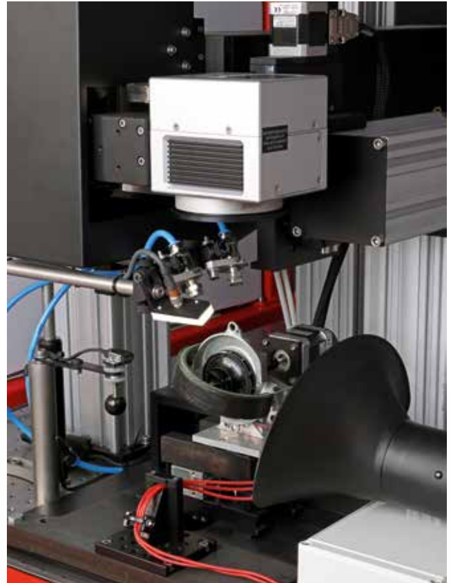
Fixtures with quick loading mechanisms support the efficiency of NanoBalancer for manual loading processes.

Depending on the shape of the rotor, one or two laser sources are active. With two lasers, the simultaneous processing in the planes saves time.