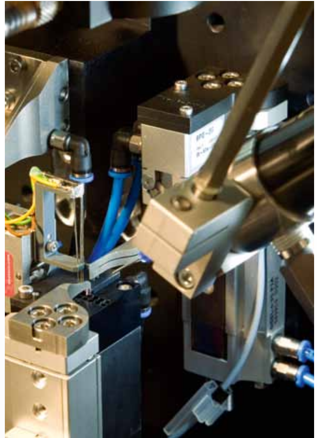
The configuration of NanoGlue is customized depending on the assembly requirements.

Illumination of the working area uses LEDs with wavelengths from blue to near infrared depending on the characteristics of the surface to be detected.