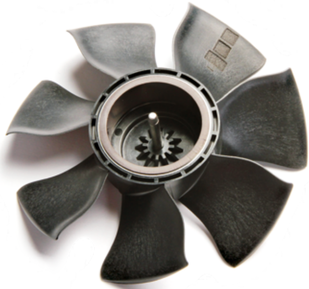
Typical work pieces are impellers for technical or medical equipment, air-driven turbines and small rotors of miniature motors.

For impellers made of plastics, a CO 2 laser is the ideal choice. Practically all plastic materials absorb the radiation of 10.6 µm. The glass fibers for enforcement of the work piece are no obstacles. The processing of impellers made of metals requires different laser delivering pulses with substantially higher peak power. Lasers generating pulses in the range of 10 ps are well-suited to remove metals clean and without burrs.